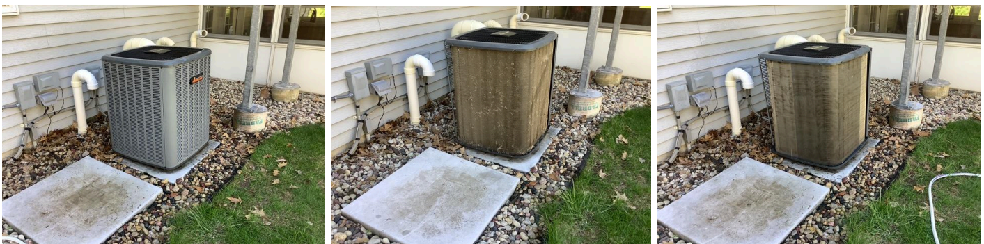
1. With guard on; unable to see how dirty. 2. Able to see; full of cottonwood fuzz. 3. After cleaning; free of dirt & fuzz!